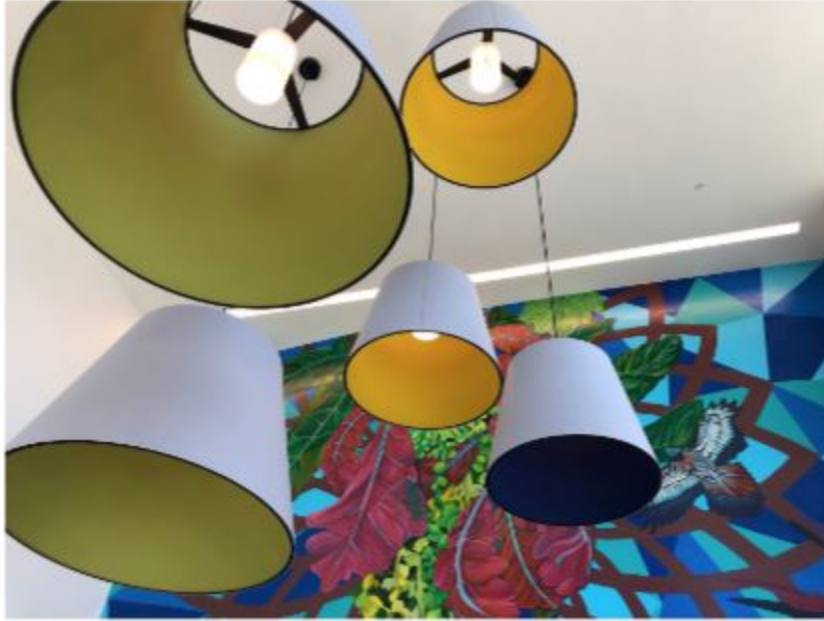
Drum Lighting in custom colors